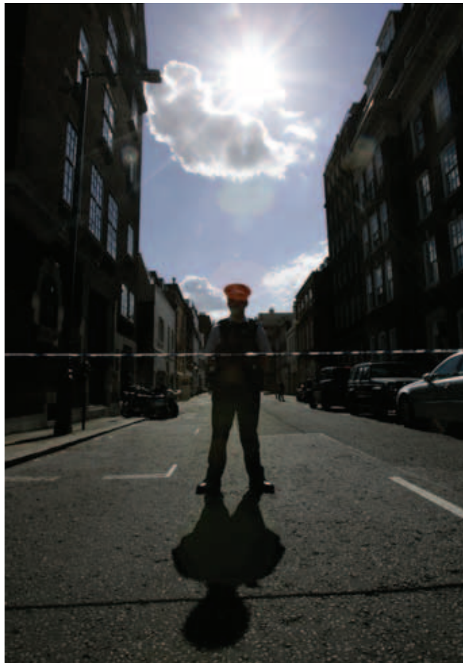
'The country's lack of self-confidence is in stark contrast to the implacability of its Islamist terrorist enemy, within and without.' A policeman stands at a cordon in a London street after a failed car bomb attack, 29 June 2007.

Latent risks can become patent threats. What marks the change of a risk into a threat is usually the emergence of a factor which has been misjudged. It has been the reduction of traditional threats (aggression from nation states) combined with the increase of possible risk factors (most notably, Islamist terrorism, but there are many others) which has so destabilised world affairs and increased uncertainty. But linked to these changes is a loss in the United Kingdom of confidence in our own identity, values, constitution and institutions. 'This England that was wont