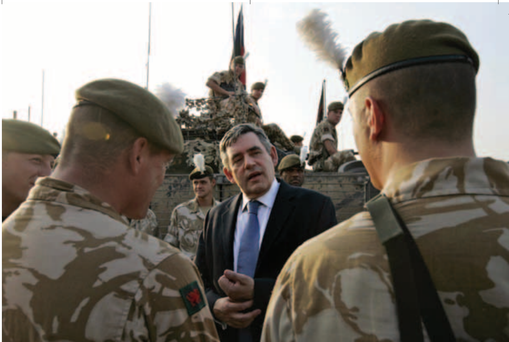
Our loss of cultural self-confidence', Prins and Salisbury argue, 'weakens our ability to develop new means to provide for our security in the face of new risks.' British Prime Minister Gordon Brown talks with British troops at their base in the southern Iraqi city of Basra, 2 October 2007.

wherever they are – for instance in the unprecedented 2007 cyber-attack on Estonia, in which state resources were apparently complicit. The opportunity to engage Russia in the world economy efficiently (as opposed to colluding with robber baron capitalism) was squandered by those from the West who gave advice in the 1990s. We are yet to see the full bill for these errors. Meanwhile both birth rates and life expectancy in Russia continue dramatically to slide, compounding the ferocity of the new nationalism with a tragic urgency.